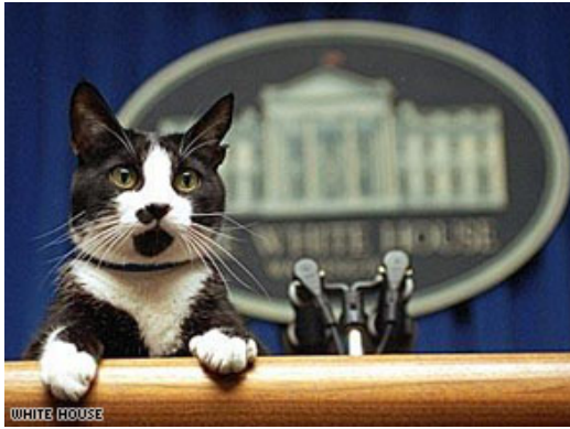
President Clinton's cat Socks.

The presidential pets are very important.