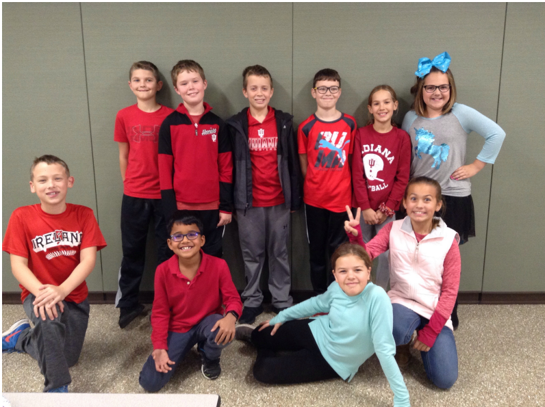
Great work to the Spell Bowl team. They celebrated the day after the Spell Bowl with a pizza party in the LGI Room. Our team came in 42nd in the state!