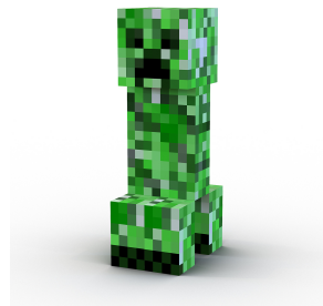
This is a creeper from Minecraft.

Minecraft is a video game for kids all over the world to play. It is made of cubes and squares. The most popular items are The Grass Block and The Creeper Mob. The creeper is a made up animal (animals are called mobs) that sneaks up on you and blows you up. However, that is only if you are in survival mode. There are 2 modes. Survival and Creative. (There is also adventure mode but that one is boring and nobody uses it.) In survival mode, you are kind of like in real life. In creative mode, you can do anything you want like fly, have unlimited items, and more cool features. In adventure mode, you can't do anything but move. Yeah, that's it about adventure mode. There are made up mobs, and others that are in real life like pigs, cows, chickens, sheep, bats, foxes, wolves, fish, and more. The made up creatures are creepers, zombies, skeletons, endermen, the ender dragon, and more. There are also NPC villages. In the villages, there are wells, houses, and let's not forget villagers! Villagers are the NPC's inside the villages. The farmers grow food, and you can trade with others! There are dangerous pillagers too. They are evil NPC's that kill the villagers. It is completely safe for kids. There are no bad things that kids shouldn't see. It is completely kid friendly. There are lots more cool features about Minecraft, but that is all we can think of. So go download Minecraft! Only $6.99 on mobile devices!